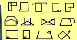
Electric Panel Angle Control with 20 programmable bending