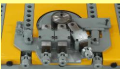
Spiral Attachment for iron bar from Ø6 to Ø25.