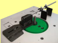
“UNIQUE” Stirrup bender + linear measurer