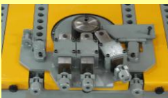
Spiral Attachment for iron bar from Ø6 to Ø25.